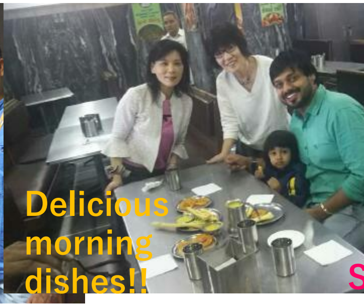
Delicious morning dishes!!