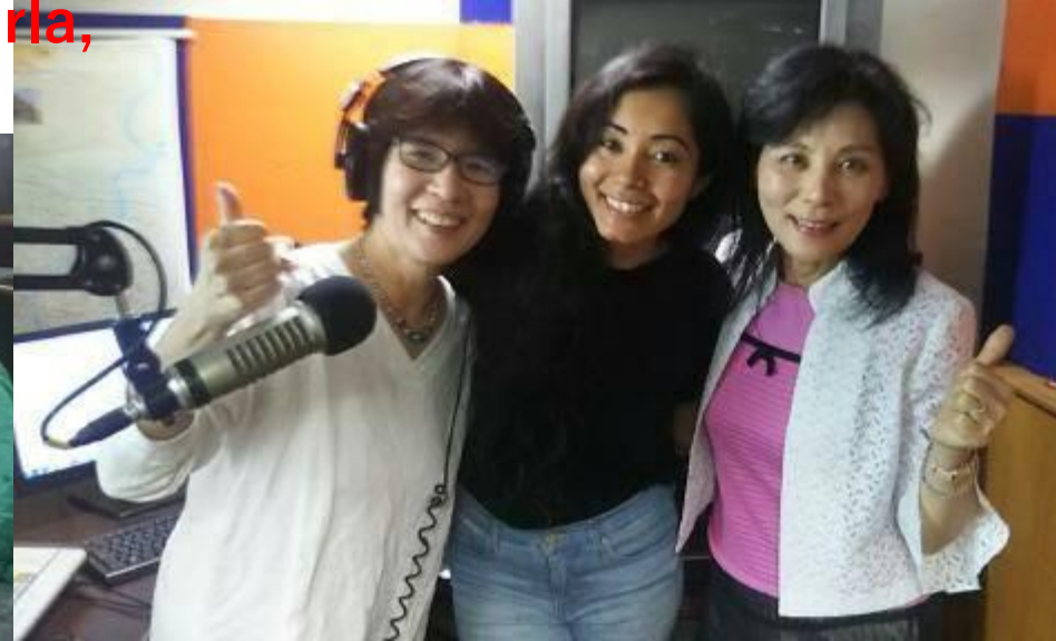
Sakura Sakura ♪ @FMRadioCity