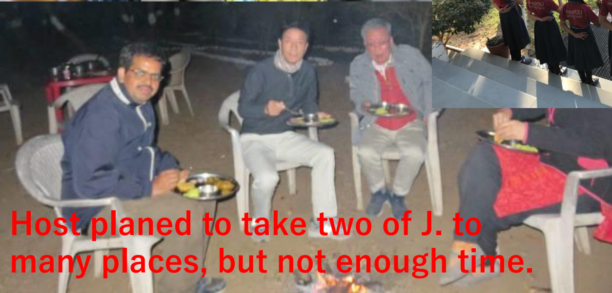
Host planed to take two of J. to many places, but not enough time.