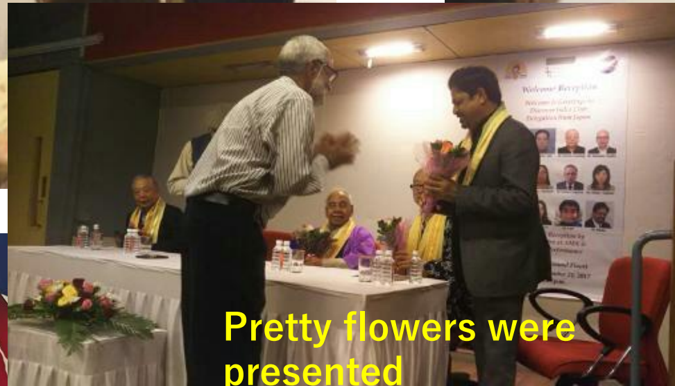
Pretty flowers were presented